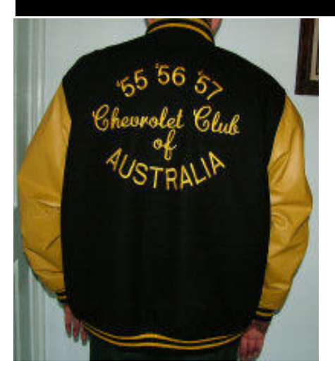
Club Jacket (order only, Dep. Required) $250