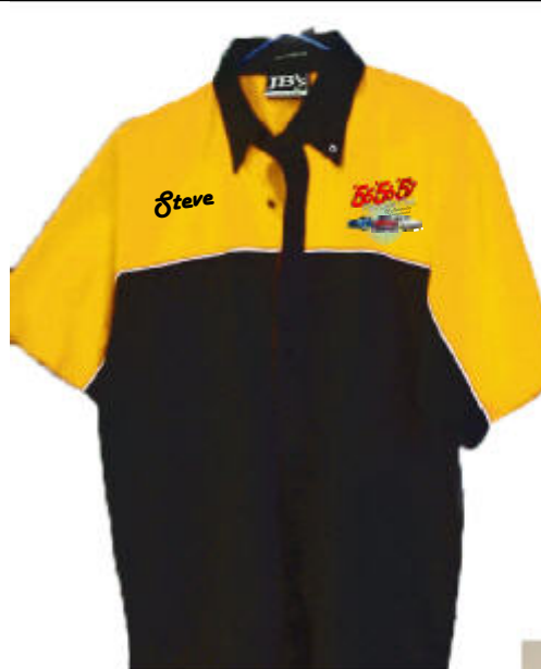
Bowling style shirts Mens Shirt $35.00 Embroidery of name $5.00