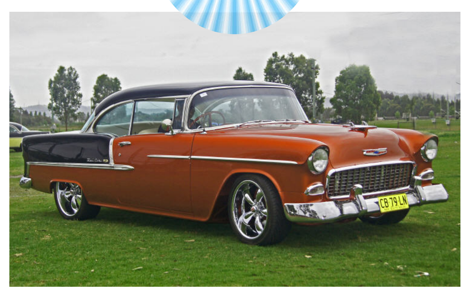
Official newsletter of the '55 '56 '57 Chevrolet Club of Australia