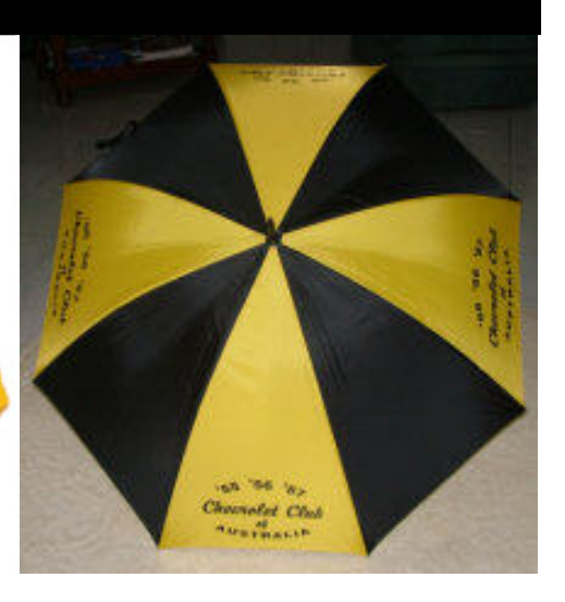
Club Umbrella $30.00