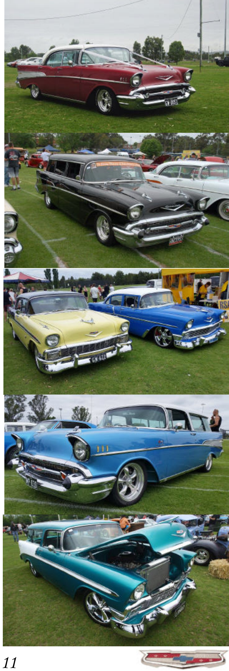
The Classic Chronicles