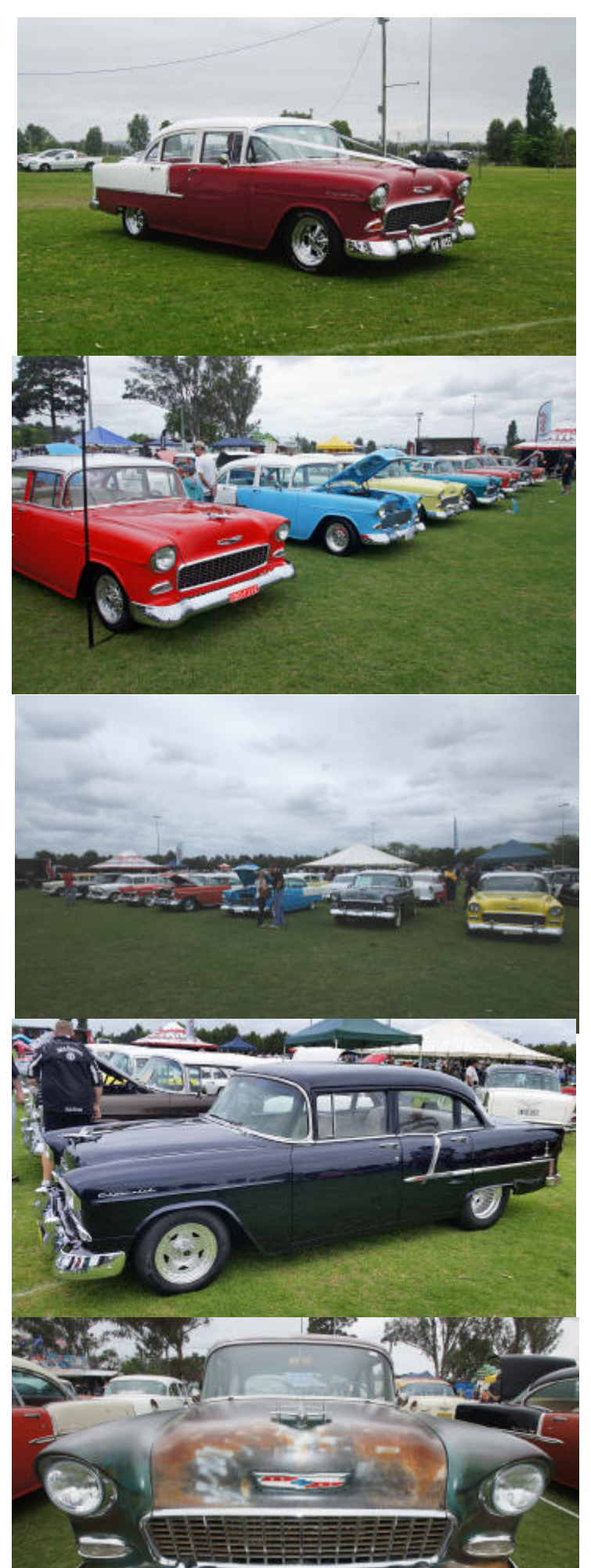
The Classic Chronicles