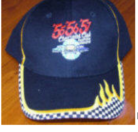
Club Cap $15.00