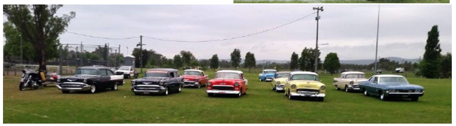
The Classic Chronicles